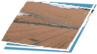
Patched roof and rotting soffit at EMS