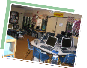
One elementary school library that is almost up to date!