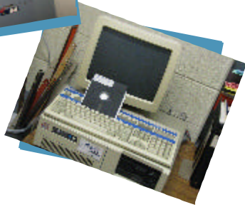
Old energy management system