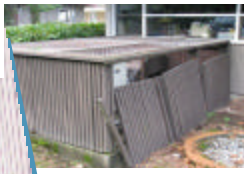
25-year old heat pumps are beyond their useful life.