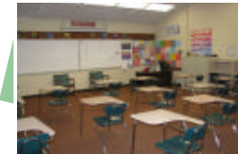
High tech? Low Tech? How about No Tech?