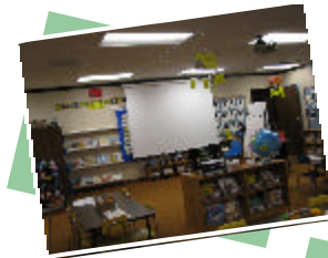
This first grade classroom is getting closer to the "Intelligent Classroom"