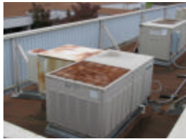
Rusted heat pumps on roof