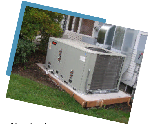
New heat pump