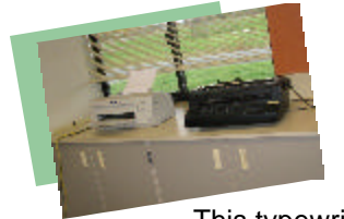
This typewriter was actually found in a real classroom-- plugged in!