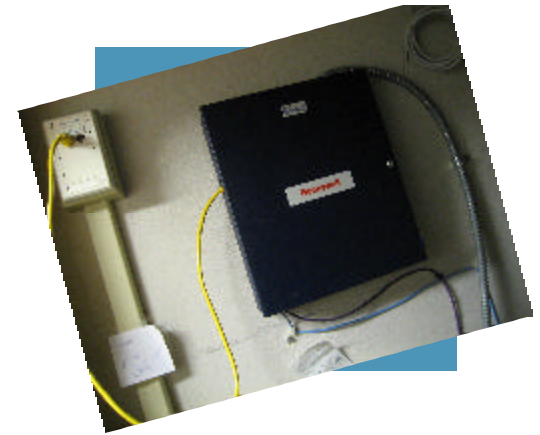
New web-based control system can be accessed from any district PC